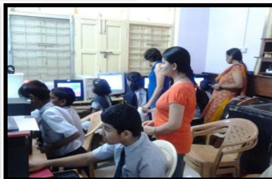
Children working with scratch and making things like Aquarium