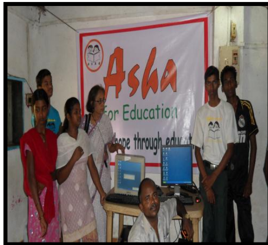
Asha Mumbai supporting Adivasi village in Powai

Achievements: Asha Mumbai is proud to say that all the students who come to us are jumping with the mood to learn, they are becoming confident and motivated to do something actively in life apart from the academic improvement.