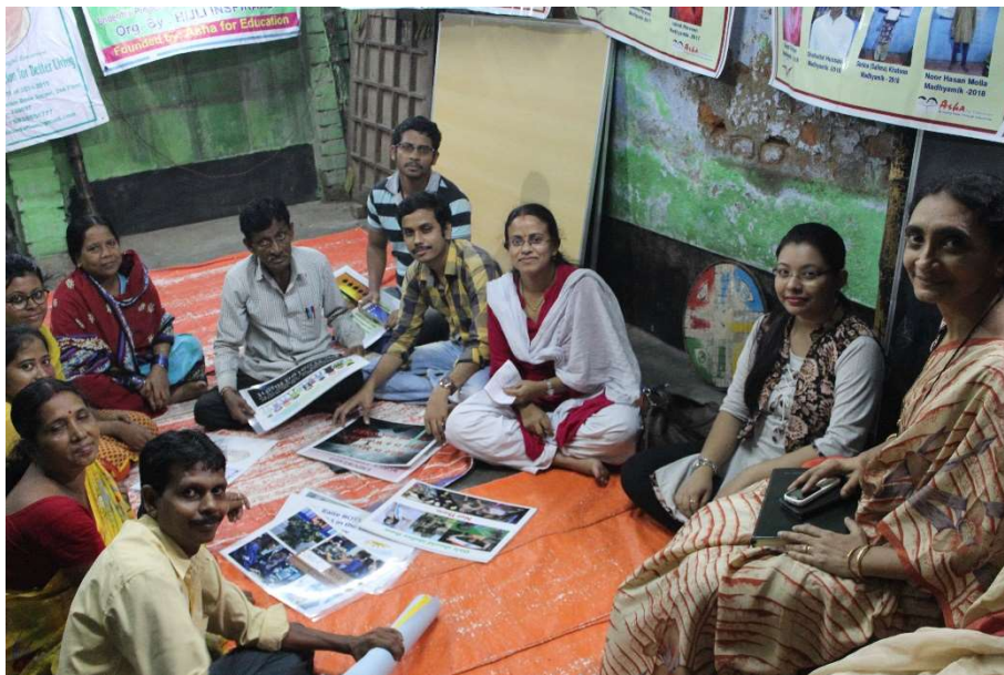
Teachers During Workshop