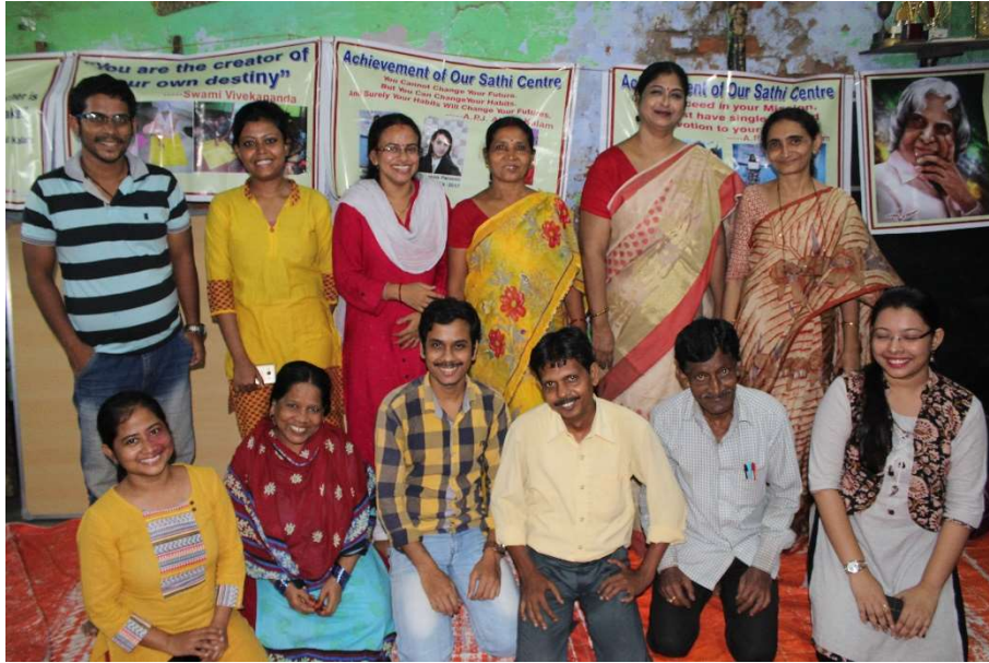
Teachers and Trainers after workshop