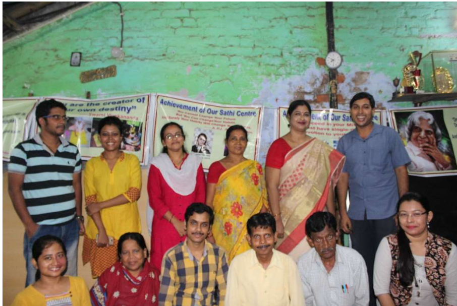
Teachers and Trainers with me after workshop