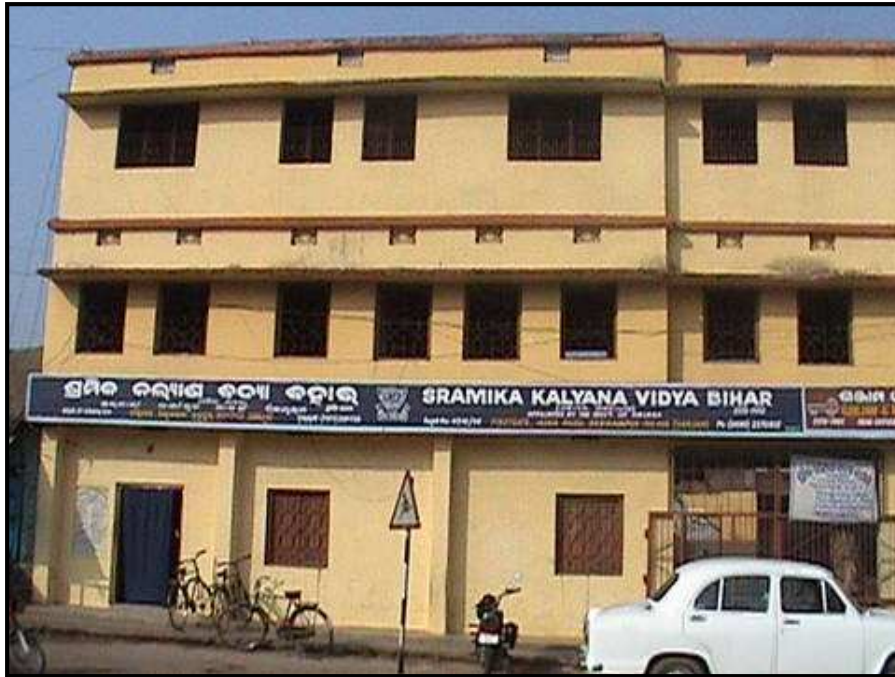
School supported by Asha